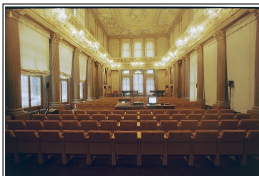
A picture of the Concert Hall at the Conservatory Benedetto Marcello, Venezia