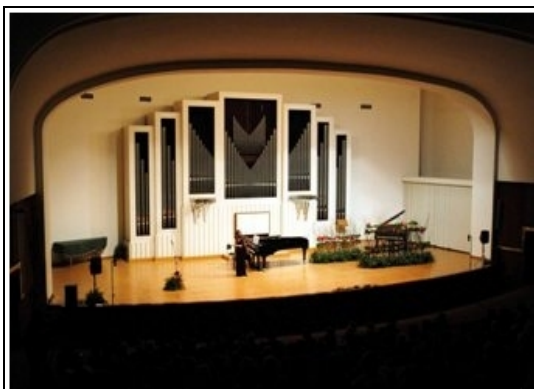
A picture of the Concert Hall at the Conservatory Cesare Pollini, Padova

The conference can also provide a variety of microphones (including contact microphones) and electroacoustic accessories.