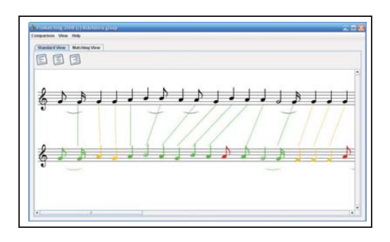
Figure 2 . Example of local feedback. The upper line is the score to perform. Below, the performance contains green matching notes, red notes which have been inserted and yellow notes with the bad pitch.

Thanks to presented research (section 5), a player can have the freedom to modify the tempo of the music. Instead of giving him note onset, a score can be made with