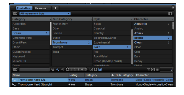
Figure 3 . Hierarchical sound search for the halion5 software synthesizer. Categories are presented in a tabular way, starting with highest hierarchical level in the first column. For each level a list of possible values can be selected by the user. The hierarchy filters the result list by performing a logical AND operation.

In order to perform interactive user tests we developed a software synthesizer that incorporates both a standard control interface and a natural language input system, allowing