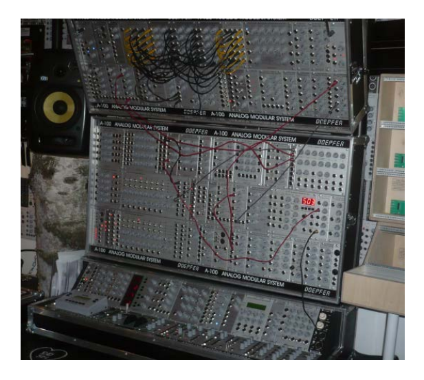
Figure 1. A modular analog synthesizer by Doepfer presented on this year's Musikmesse in Frankfurt. The impressive interface represents the internal functional complexity of the system, inviting the user to experiment with the system. Relating a certain system configuration to a specific sound or vice verse is hard.

In current systems two main approaches for identifying sounds can be distingushed: naming conventions and hierarchical meta data.