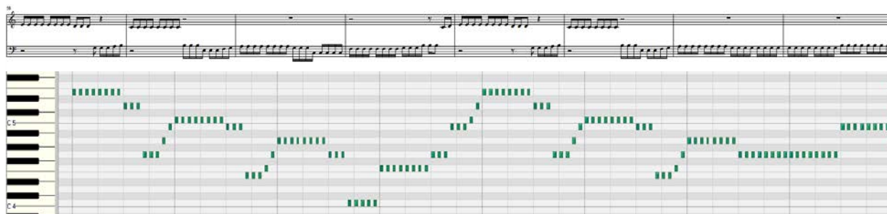
Figure 2. The melody of the second Interlude as notes and MIDI piano roll showing the wave-like progression.