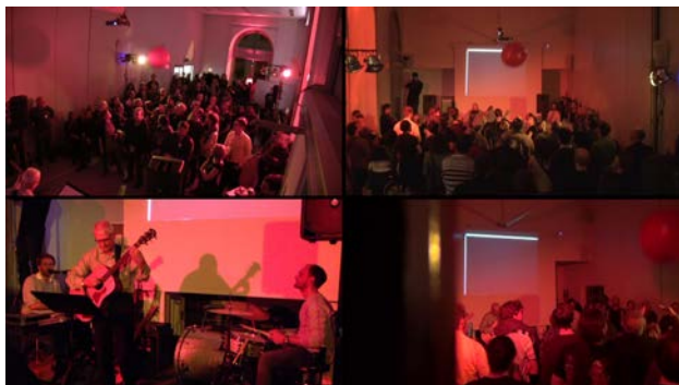
Figure 5. Four cameras synchronised in one screen for video-analysis.

plicable for a live concert without any loss of plausibility or credibility.