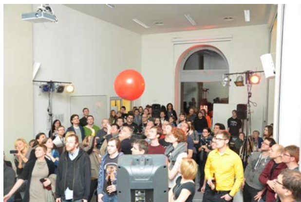
Figure 1. Balloon in the audience.

This approach originated from the idea to develop a versatile and engaging concept for interactive audience participation which includes all spectators. Unlike other interventions exploring audience participation, no additional