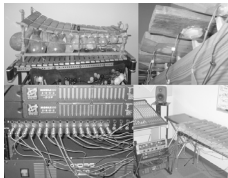
Figure 3. Top left: Gyl on top of vibraphone for showing scale, Top right: piezo sensors under bars, Bottom Left: 2882 input, Bottom Right: overview

The field of computational ethnomusicology is still in its infancy and most of existing work is exploratory. As the field matures it can play an increasing role in addressing long standing musicological questions. This will require more active involvement of musicologists who can formulate hypotheses that can then be tested empirically through computational analysis. The majority of existing work in CE (and MIR for that matter) is centered around processing collections of audio recordings. An audio recording consists of the mixture of a number of individual instru-