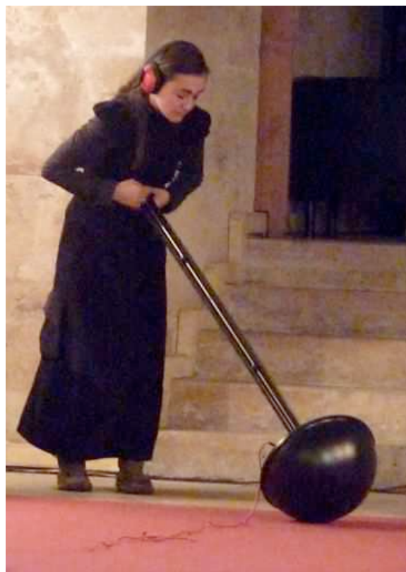
Figure 5. Posture on Listening Station

to our own voice [6]. This feeling is very present here and modifies the usual representation of our body in space, moving borders from outside and from within [7].