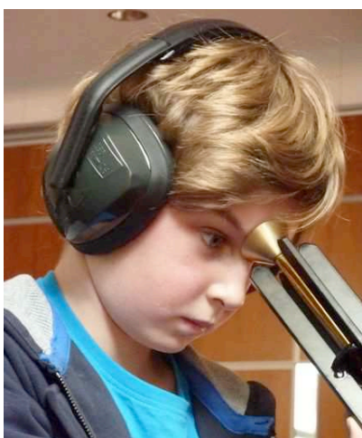
Figure 2. Listening Station

Likewise, the solid Listening Stations are devices that enable one to perceive sound through bone conduction. A vibrating metal rod, in contact with one's chin or other parts of the head, enable one to become aware of extremely precise sound information, without air conduction.