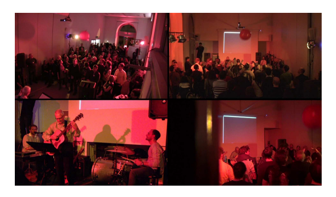
Figure 5 . Four cameras synchronised in one screen for video-analysis.

plicable for a live concert without any loss of plausibility or credibility.