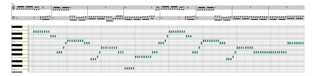
Figure 2. The melody of the second Interlude as notes and MIDI piano roll showing the wave-like progression.

Introduction, Verse and Interlude: 4a: C G/H I Am Am/G | F G Em Ι V/VII | vi vi/V IV iii | ii G/H F (Gsus) G 4b: C Am Am/G vi/V V/VII νi (Vsus) G/H Αm Fm/G# | Fmaj7 Gsus G IVmaj7 V/VII 4c: I vi iv/V# Vsus V G/H F 4d: C I Am F.m CG 4d: T V/VII iii ΙV 1 Chorus: 6e: F G | Am F G \mathbf{E} Am G F G 6e: IV V vi IV V | III vi V IV