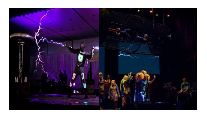
Figure 2 . - Left - ArcAttack. Right - Björk performing 'Thunderbolt' live with Tesla Coil above.

Copyright: © 2014 First Author et al. This is an open-access article distributed under the terms of the <u>Creative Commons Attribution License 3.0</u> <u>Unported</u>, which permits unrestricted use, distribution, and reproduction in any medium, provided the original author and source are credited.