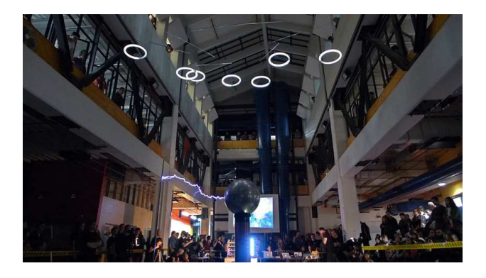
Figure 1. - A live Tesla Coil in a musical performance.

The Tesla Coil has become a fascination of many, spawning a community of hobbyists and enthusiasts who build their own coils. As well as a strong hobbyist community, Tesla Coils have been installed in museums, schools and universities. The interest in Tesla Coils is often in their visual and physical qualities, as they can produce impressive electrical arcs, often spanning meters. These electrical arcs also produce sound, and many Tesla Coils are now built to be 'Singing Tesla Coils', also known as 'Zeusaphones'; a portmanteau of Zeus and sousaphone. These coils modulate the input to the coil, in order to control the frequency of the energy discharges.