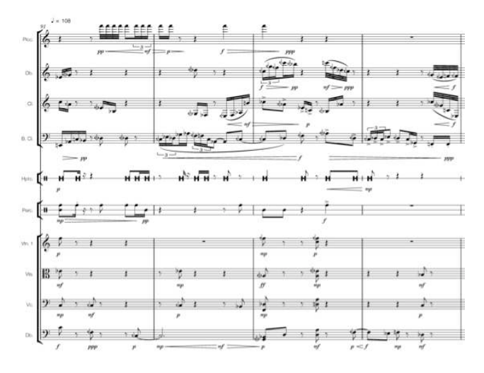
Figure 3 . Scoring for haptics in the composition, Traum . The haptic line is the 5^{th} stave from the top.

traditional western transcriptions, but with custom "H" note-head, the haptic notes contain data relating to vibration onset, duration, speed and position. Combinations of these parameters were specified as part of the compositional process.