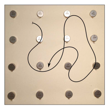
Figure 2. Haptic gestural path through VAM.

A configurable and extensible transdomain mapping strategy is currently being employed. Informed by existing literature on haptic perception and psychophysics [18, 19], a prototype algorithm to precisely control the actuator output and facilitate haptic rendering has been developed. At this stage there are several parameters of vibration that can be controlled by the software including duration, intensity, and location. The system is currently designed to facilitate haptic reconstructions preprogramed and triggered by the composer, with a view to extending it to include functionality to produce ad-lib . reconstructions for pre-existing works.