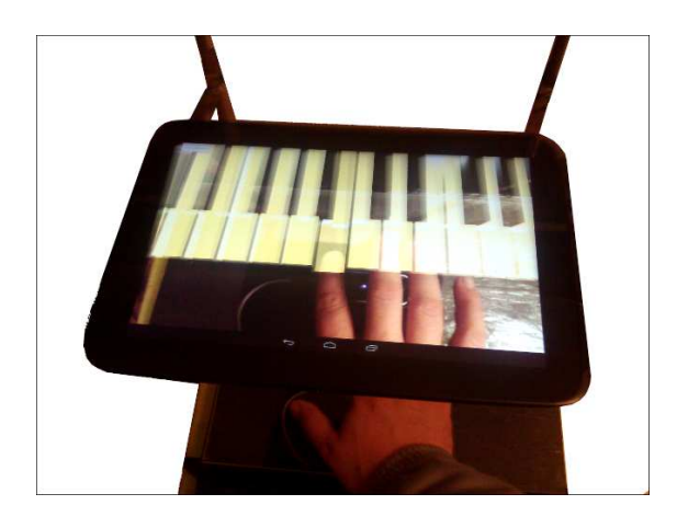
Figure 1 . On-screen projection of the augmented piano keyboard in action.

The prototyped concept is depicted in Figure 1: it consists