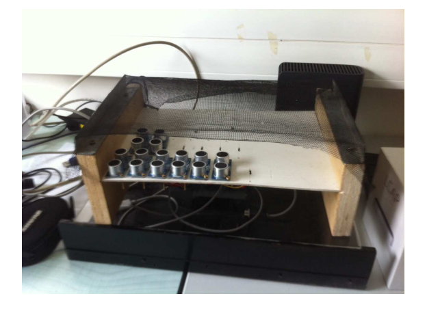
Figure 3. Ultrasound matrix, for eight keys.

We set up another system consisting of a narrow matrix of eight HC-SR04 ultrasound sensors (see Figure 3). These sensors perform best and at highest rate (i.e. 200 fps) if tuned to detect objects between 20 and 30 millimeters: for these distances in fact the sound emission-reflection mechanism, based on pulse-width modulation (PWM), runs optimally.