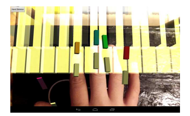
Figure 2. Detection using Leap Motion, with marked fingers.

using this procedure was annoying, as well as the latency exceedingly high.