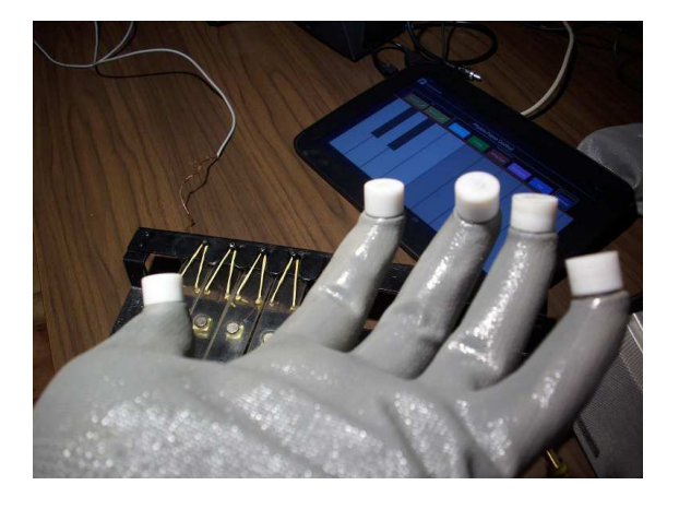
Figure 5. Magnetic glove.

In alternative, we asked pianists to wear gloves mounting small magnets at the fingertips (see Figure 5); then,