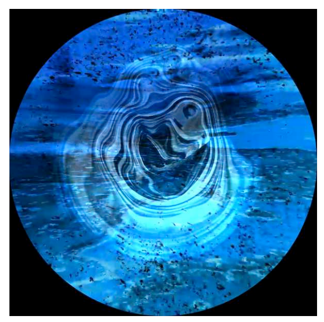
Figure 1. Frame taken from Chronotope Visual Music Project created in Fulldome format by Ivan Zavada.

The accompanying visual music work Chronotope explores the synergy and correlation between diverse forms of media, from the minute motions of human skeletal muscle cells captured on microscopic time-lapse video, to large scale digital areal photographs of the Great Barrier Reef and other typical images of the vast Australian land-scape intricately layered into new audiovisual compositions creating astounding abstract universes. Chronotope is a representation of the multi-scale world we live in through the blending of senses allowing the composer to express atypical interpretations of natural phenomena and abstract ideas (see Figure 1).