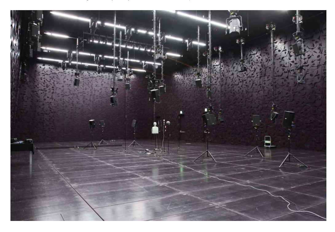
Figure 1. Motorised speaker rig and measurement setup at György Ligeti Hall at KUG Graz.

array configuration emerged, which should allow for several auditive perspectives on the space using headphones or loudspeakers. The array consists of a Brüel & Kjær dummy head with additional DPA 4060 miniature microphones located on its temples, a Schoeps spherical microphone, a Soundfield first-order Ambisonics microphone, two omnidirectional Schoeps MK 2 H in a large AB setup and a monaural reference.